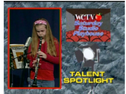
A talented flute player performs in Saturday Studio

For more information about the Saturday Studio Playhouse, check the WCTV Program schedule – you can pick up a copy at the Town Hall, Library or Senior Center, or